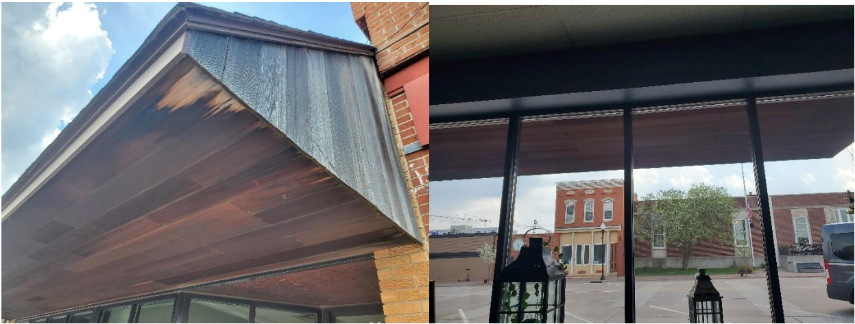
In disrepair and home to many wasps!