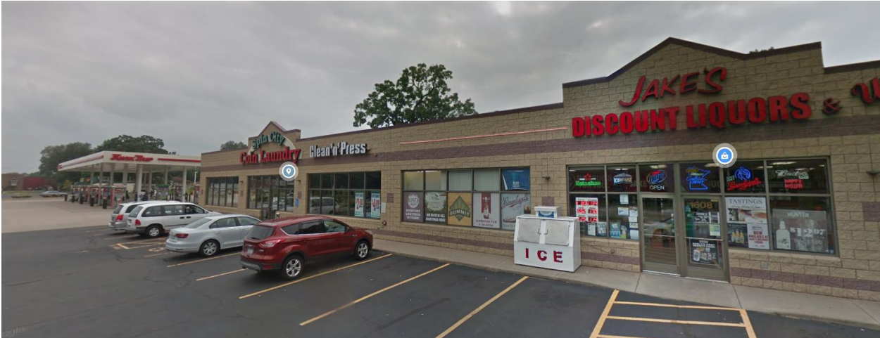
Looking south along Vermillion Street