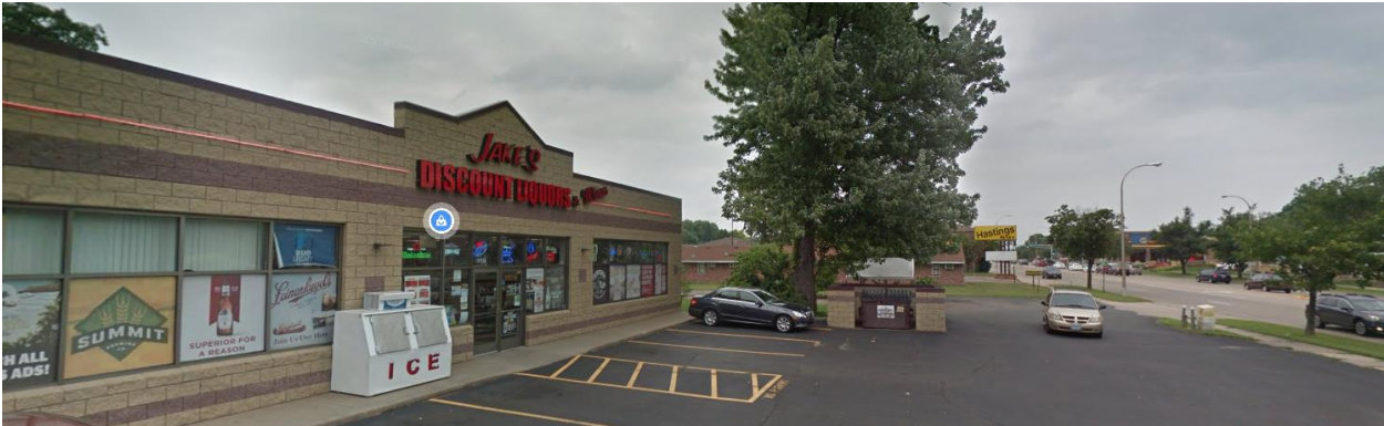
Looking north along Vermillion Street