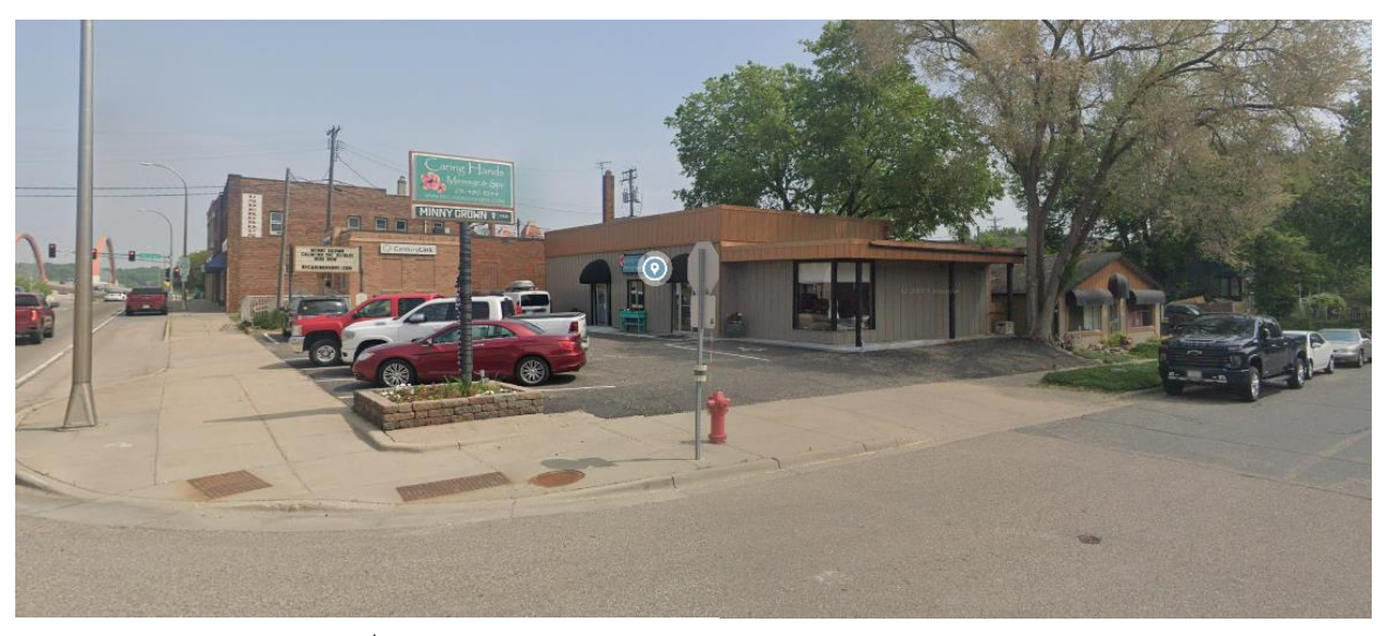
Looking northeast from 5<sup>th</sup> and Vermillion Streets