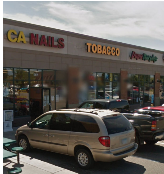
Looking east from front parking lot off South Frontage Rd.