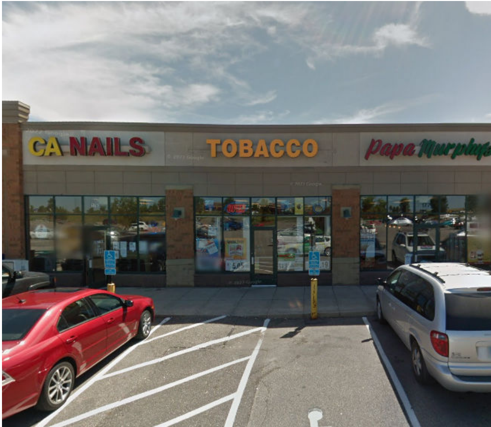
Looking south from front parking lot off South Frontage Rd.