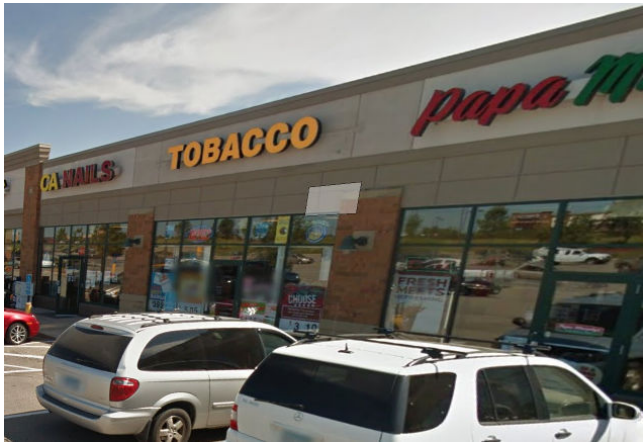
Looking west from front parking lot off South Frontage Rd.