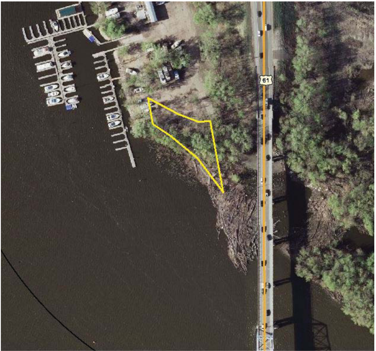
This map shows an approximate location of the fill. Fill areas are proposed to be behind the OHW of 681.7