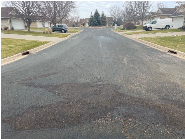
Carleton Pl – looking north at cul-de-sac