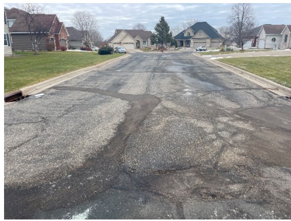
Wyndham Pl – looking east from Wyndham Hill Dr