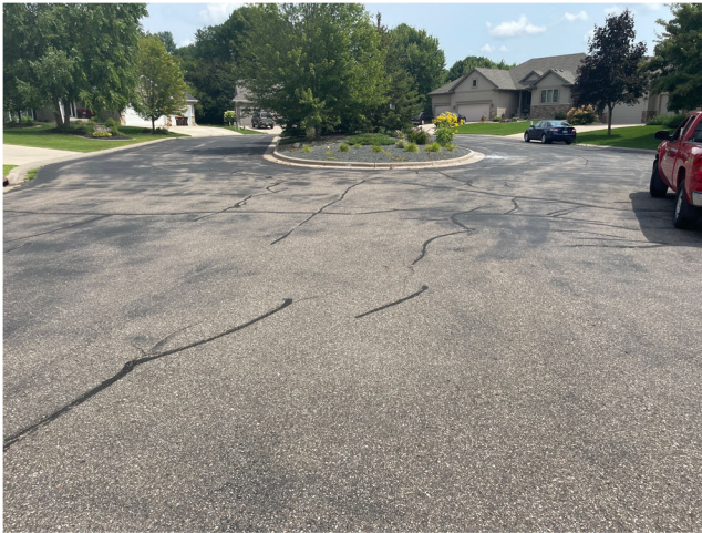
Bohlken Ct – looking east from Bohlken Dr