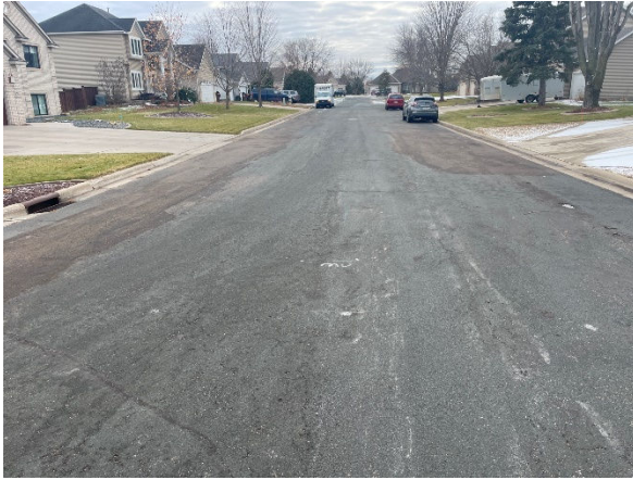
Meadow View Ct – looking south from 17 th St