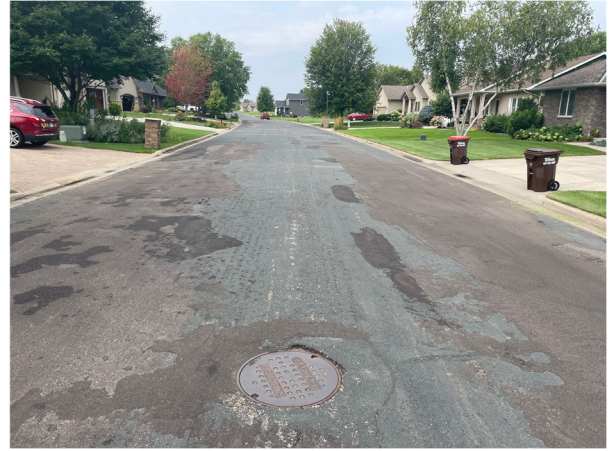
Bohlken Dr – looking south near Hackberry Dr