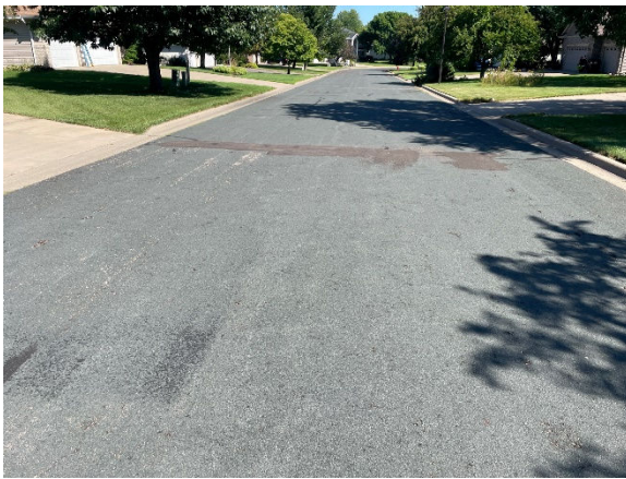
Stonegate Rd – looking north from midblock