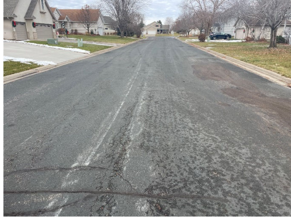
Meadow View Tr – looking east from Wyndham Hill Dr