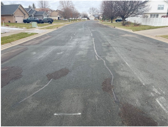
Wyndham Hill Dr – looking south from Meadow View Tr