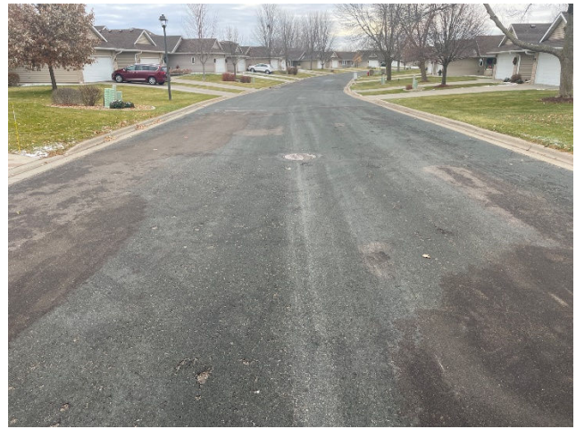
Carleton Dr – looking south from Carleton Dr cul-de-sac