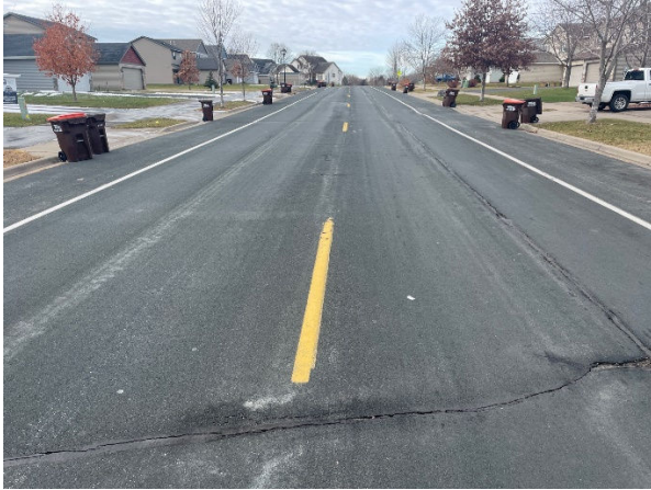
31 st St – looking west from Bohlken Dr