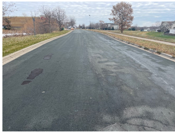
South Frontage Rd – looking east from Unnamed Rd