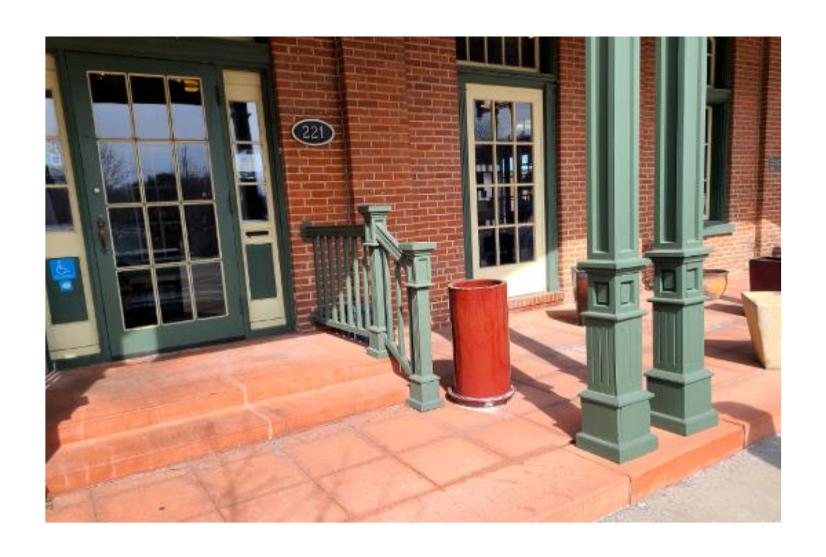
Staff rendering based on description.