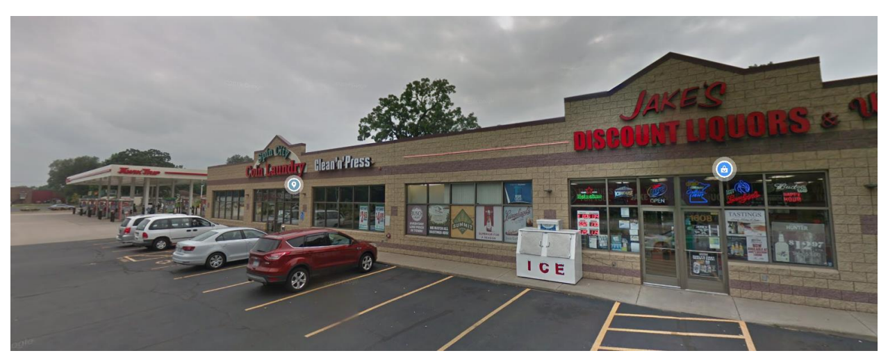
Looking south along Vermillion Stret