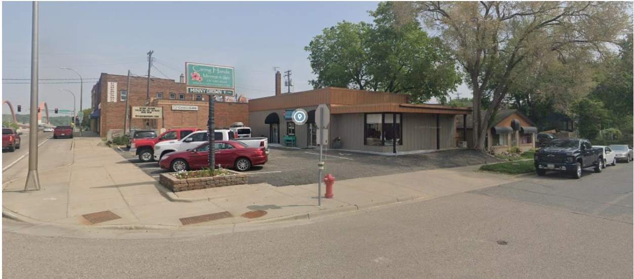
Looking northeast from 5 th and Vermillion Streets