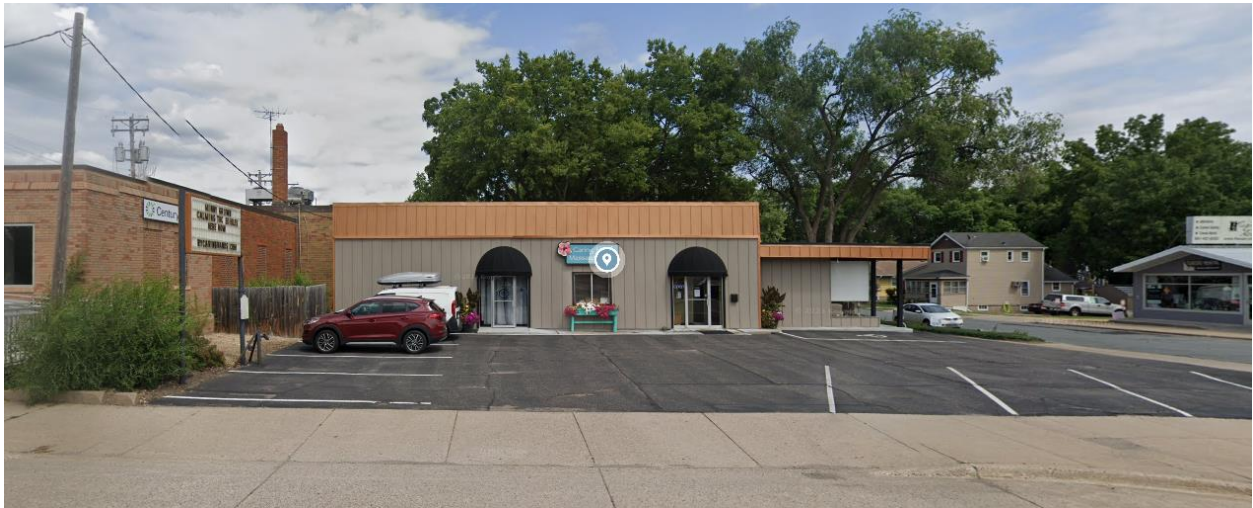
Looking east from Vermillion Street