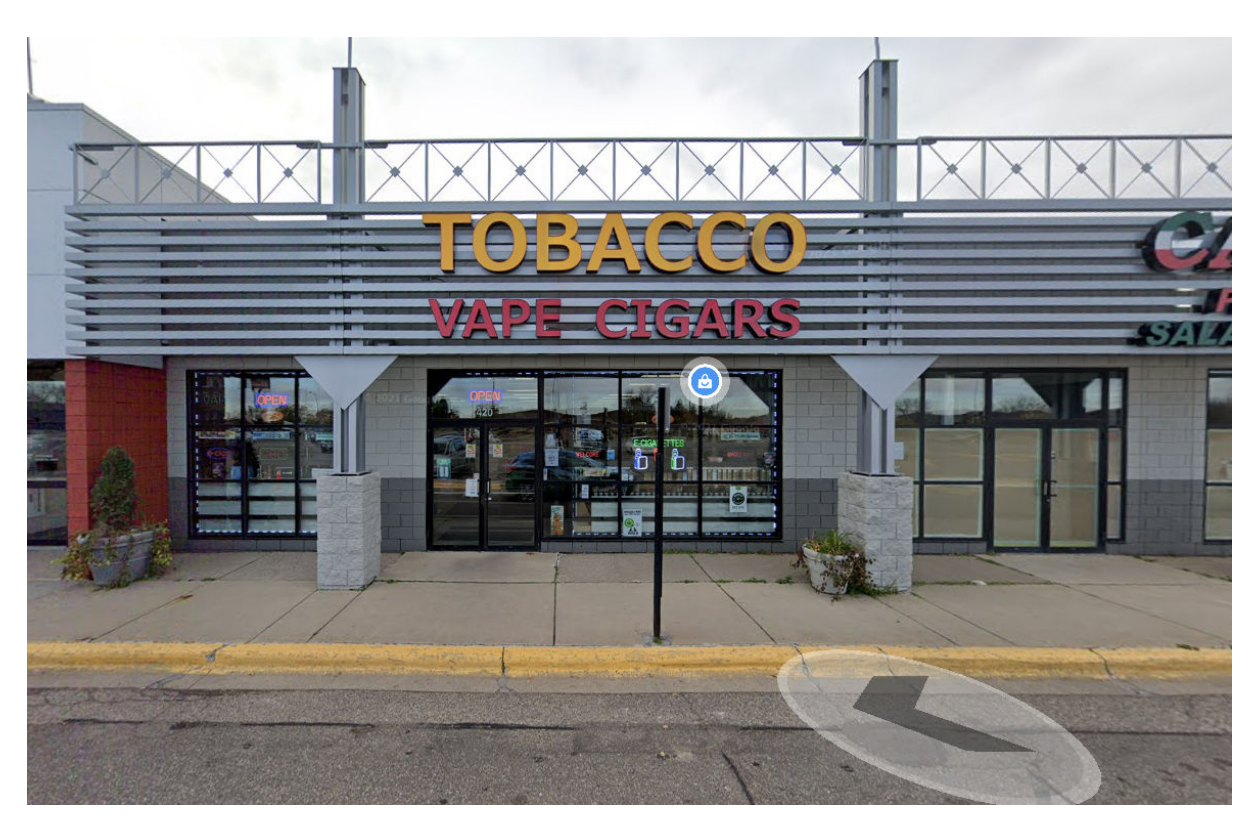
Looking south from front parking lot off 12<sup>th</sup> St. W