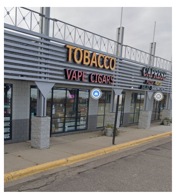
Looking east from front parking lot off 12^{th} St. W