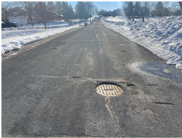
Hilltop Ln – looking east from Westview Dr