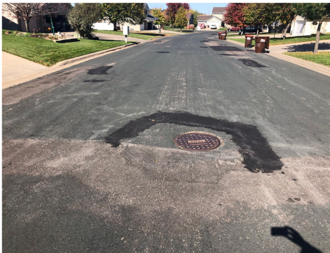
O'Connell Dr – looking north from Sunset Dr