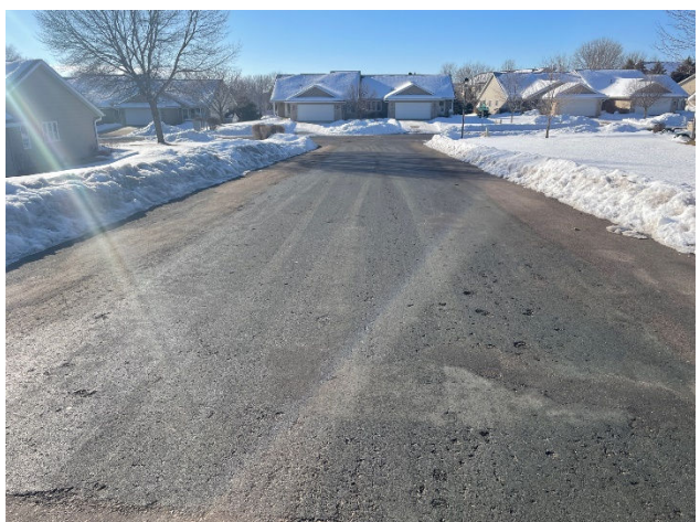
Carleton Ln – looking south from 15 th St