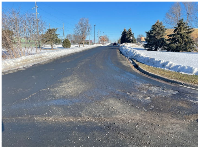
Unnamed Rd – looking north from South Frontage Rd