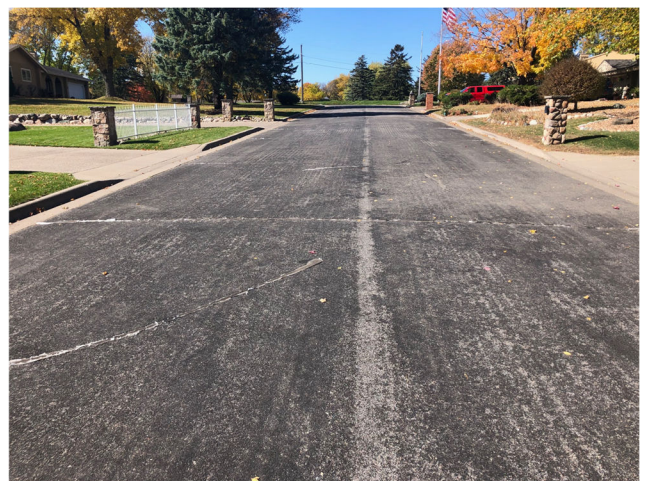
Valley Ln – looking west from midblock