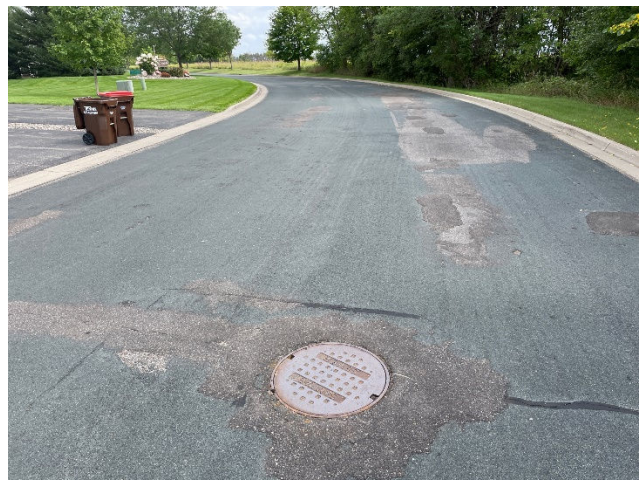
Spiral Blvd – looking east from 31 st St