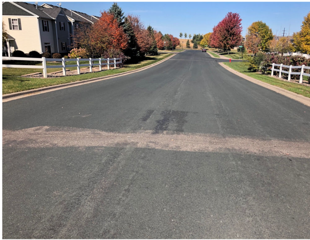
Tierney Dr – looking north from 14 th St