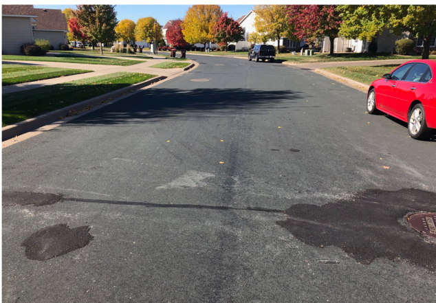
13 th St – looking west from General Sieben Dr