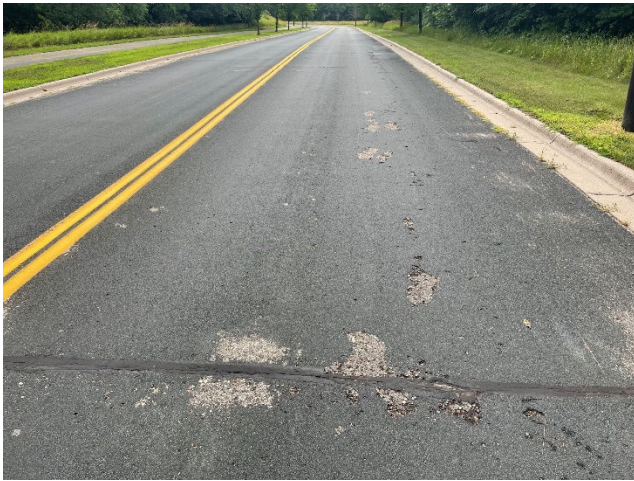
Glacier Way – looking east from 31 st St