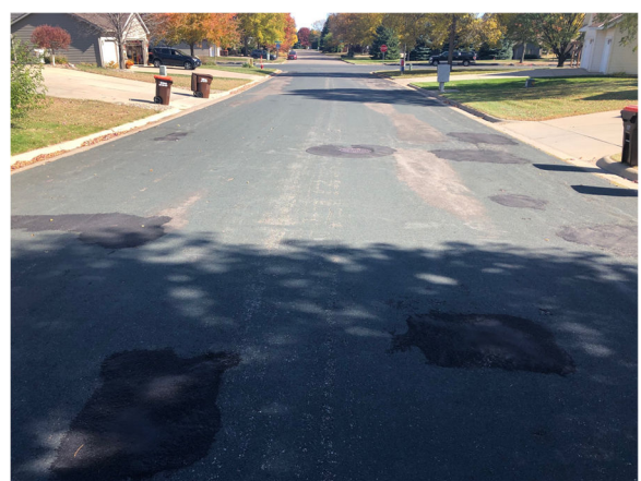
14 th St – looking east from midblock