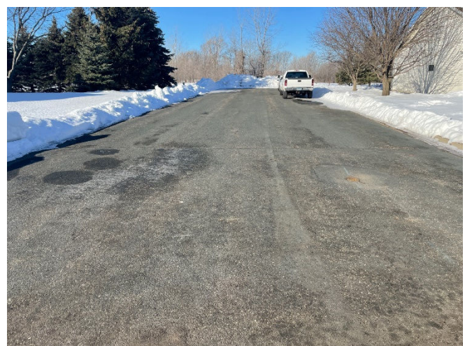
Sunset Dr – looking west from O'Connell Dr